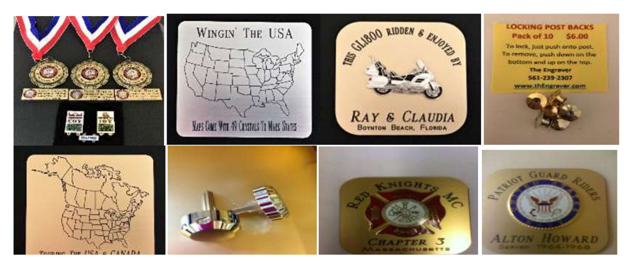
Visit our website: <u>https://ewma-il-district.weebly.com</u>

We are Lifetime GWRRA members and have been honored by GWRRA for more than 25 years of support and loyalty to GWRRA! See our ad in GWRRA Wing World magazine.