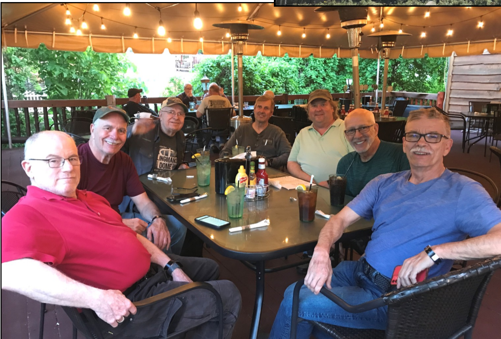
Barnsider BBQ Lake George, NY Pictured Left to Right