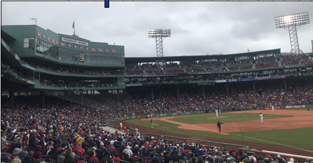
Fenway Park Massachusetts