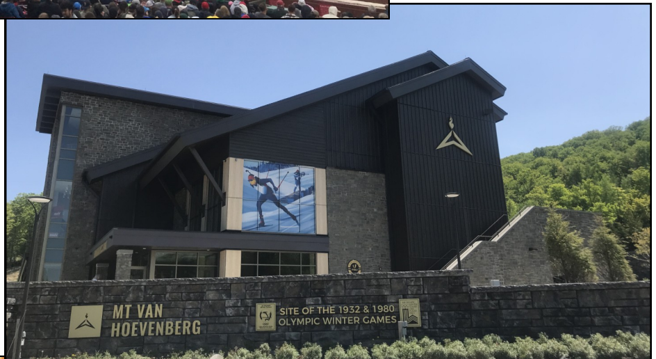
Lake Placid New York